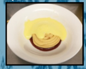
Pureed Jam Sponge & Custard WOW!

The residents have enjoyed the results with plates coming back empty.