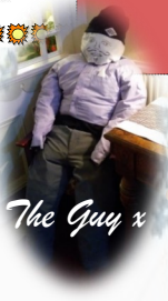
The Guy x